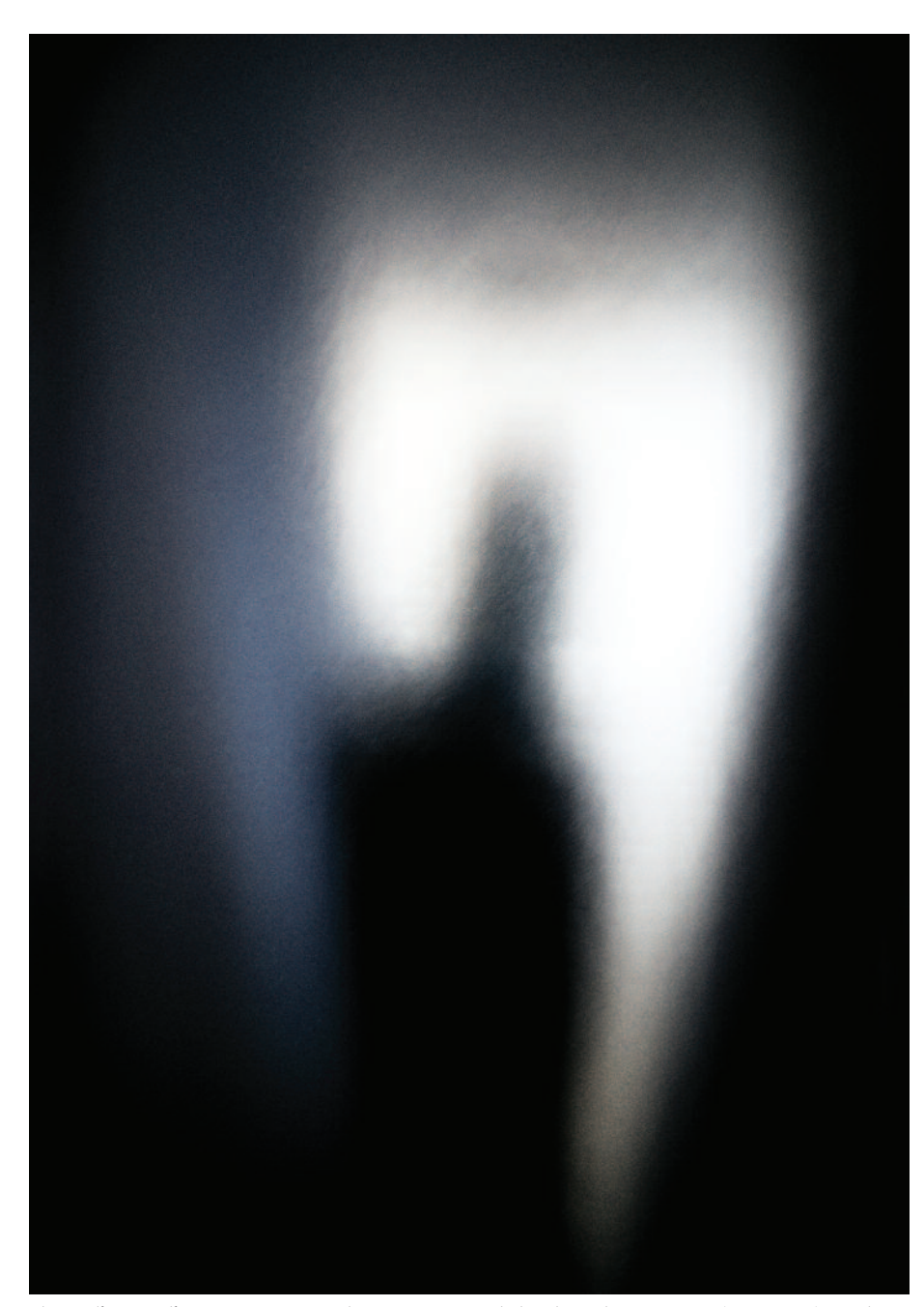
Silvio Wolf RCA Self Portrait, 2012. Direct inkjet print on mirrored plexiglass, aluminum, 70.5/16 \times 47.1/16 inches.

Entering the exhibition space one encounters, as an opening gesture, a huge high-contrast black and white photo mural showing silhouettes of two figures entering a curtained-off space. The viewer may not realize it at this point, but this is meant to